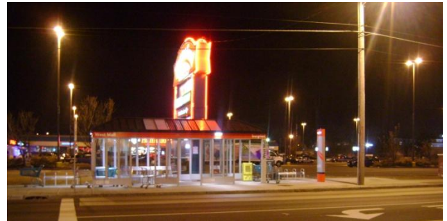
West Mall at Night