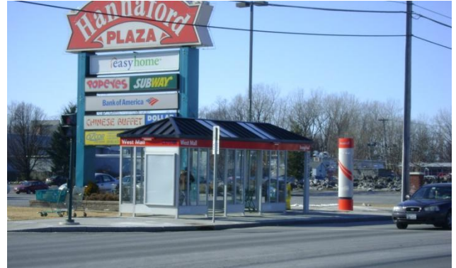
The prototype installation