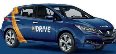
DRIVE Electric Car

We are seeing revenues rebound across a variety of operational categories and supported by continued investment from New York State and the Federal Governments. We expect Universal Access contracts with major employers and educational institutions to grow ridership totals and revenues with support from our Rensselaer Rail Station/ Facilities and customer fares lines.