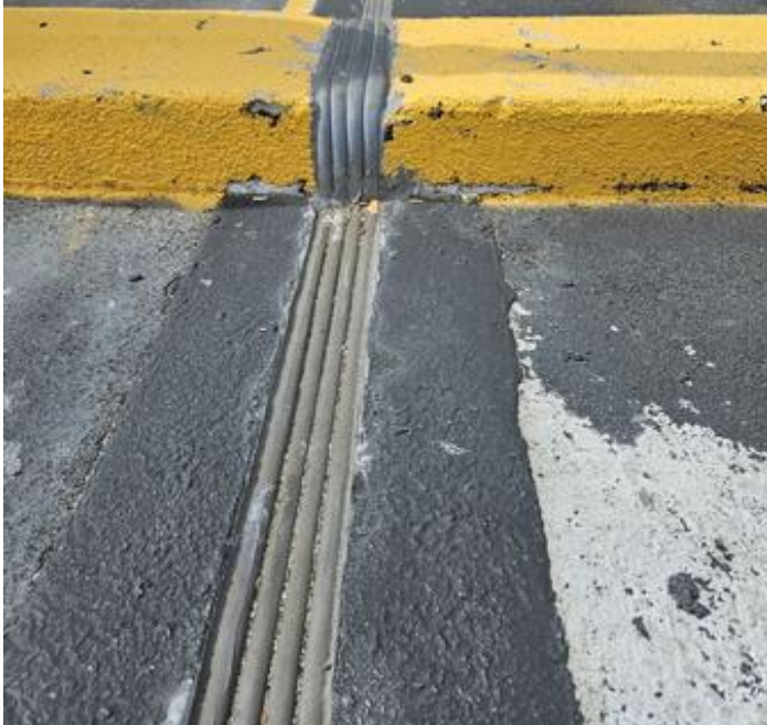
JLB Top Deck Joint Replacement