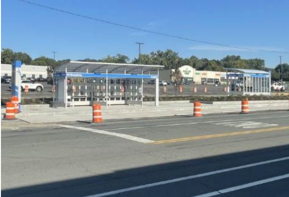
80 Broadway Blue Line Station