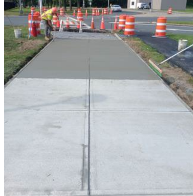
Harriman East Purple Line Station