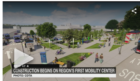
Construction is now underway on the region's first mobility center.

By WNYT Updated: April 10, 2023 - 7:43 PM Published: April 10, 2023 - 6:03 PM