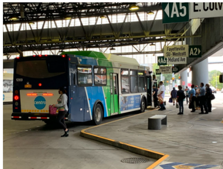
Passengers wait to board a bus at the Centro Transit Hub on South Salina Street in downtown Syracuse in this 2021 photo.

Updated: Apr. 06, 2023, 2:55 p.m. | Published: Apr. 05, 2023, 6:00 a.m.