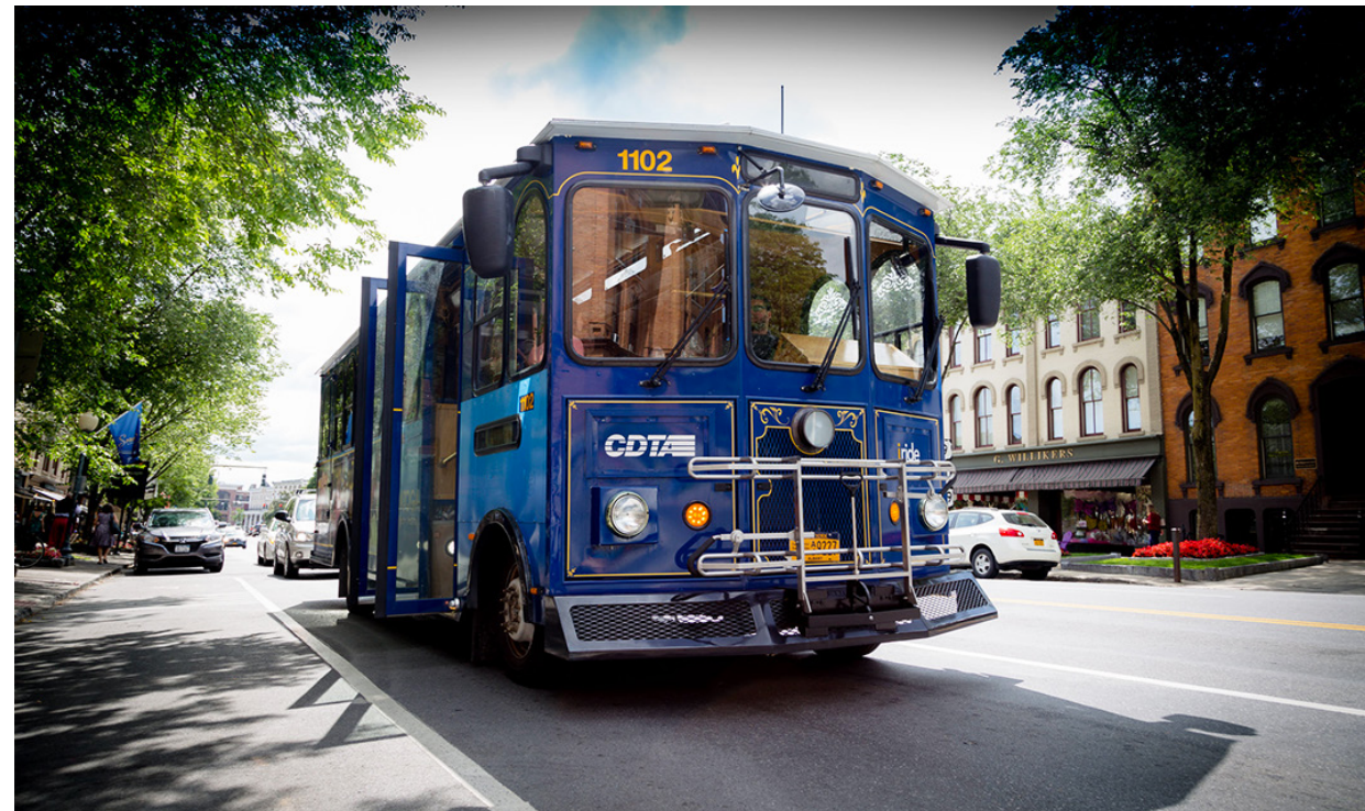
Pictured: Saratoga Summer Trolley on Broadway in Saratoga Springs.